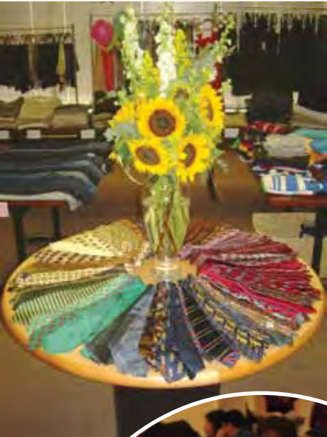
Precious Passdowns Boutique